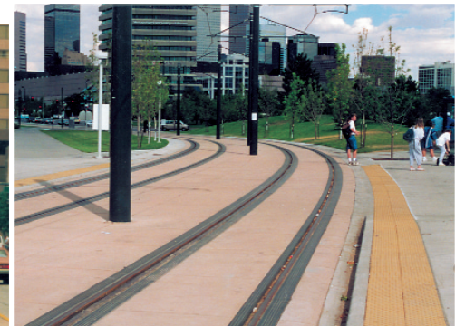
RTD Denver, Colorado. Installed October 1993