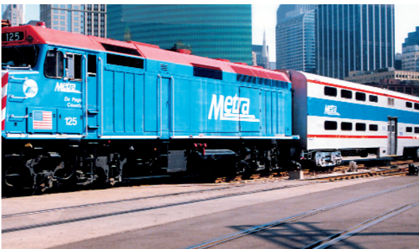
METRA - Chicago, Illinois. Installed August 1992