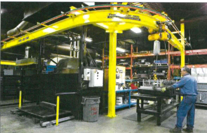
Molding secondary curing and finishing operations at Polycorp's facility.

"We focus on solutions, not being everything to everyone," Snucins said. "Our role is to fix problems. We also do everything we can to maintain a high level of quality of the products we sell, because that quality is one of our big differentiators."