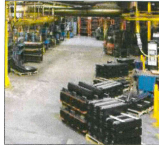
Polycorp's expansion in Elora, Ontario, will be operational in November.