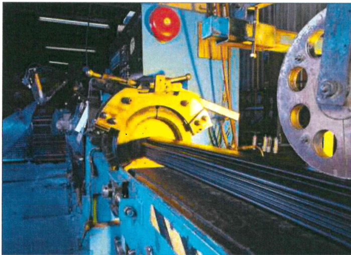
A Polycorp extrusion line at the firm's site in Elora, Ontario. To see Rubber & Plastics News' annual report on the molded goods industry, turn to Page 11.